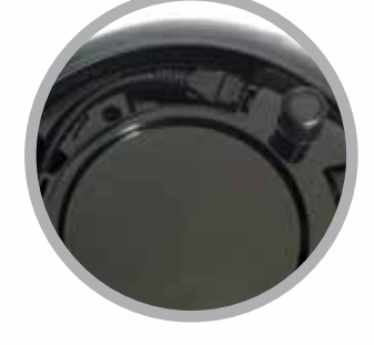
Quick change cord