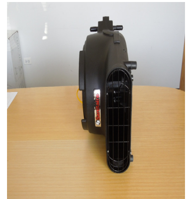
Figure 7 Sideways

The units can be stacked during storage or transport to minimize the required space. Stacking Guides are located on the top and bottom of each unit. NOTE: Do not stack more than 6 units high.