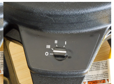
Figure 4 to turn OFF