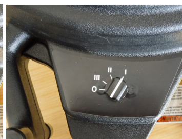
Figure 3 for Lo Speed