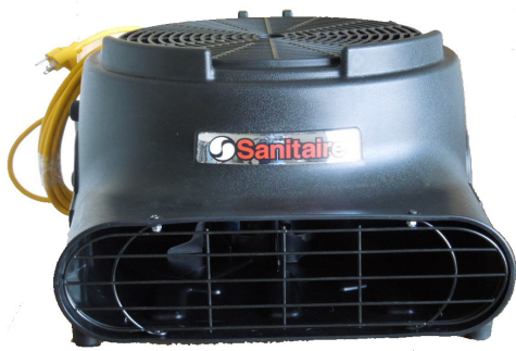
Figure 5 Horizontal

The standard orientations are, horizontal, figure 5, vertical, figure 6, and sideways figure 7. Care must be taken, especially in the sideways orientation, not to block the air intake.