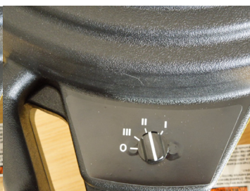
Figure 2 for Medium Speed