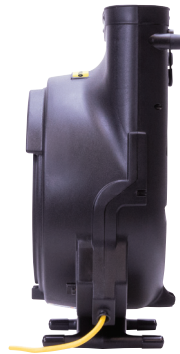
Figure 6 Vertical