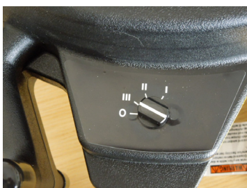
Figure 1 for High Speed

The Speed selector switch provides the following settings, III = High Speed, Figure 1; II = Medium Speed, Figure 2; I = Lo, Figure 3; and 0 = Off, Figure 4.